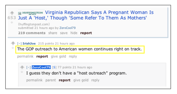
Figure 2: An illustrative reddit comment (highlighted). The title ("Virginia Republican ...") links to an article, providing one example of contextualizing content. The conversational thread in which this comment is embedded provides additional context. The comment in question was presumably intended ironically, though without the aforementioned context this would be difficult to conclude with any certainty.

Consider the following example comment taken from our dataset: "Great idea on the talkathon Cruz. Really made the republicans look like the sane ones." Did the author intend this statement ironically, or was this a subtle dig on Senator Ted Cruz? Without additional context it is difficult to know. And indeed, all three annotators requested additional context for this comment. This context at first suggests that the comment may have been intended literally: it was posted in the r/conservative subreddit (Ted Cruz is a conservative senator). But if we peruse the author's com-